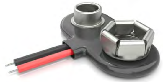
(Series Image-Reference Only)