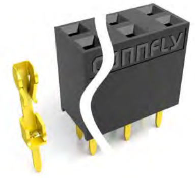
(Series Image-Reference Only)