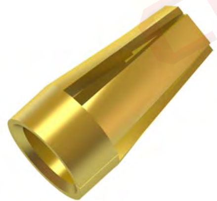
(Series Image-Reference Only)

DS1008-02 - CF X Part number code 1S 1SH 3Sx See tabel A: