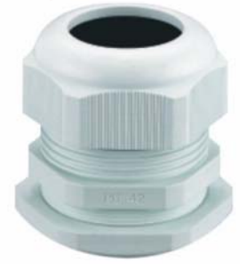
(Series Image-Reference Only)